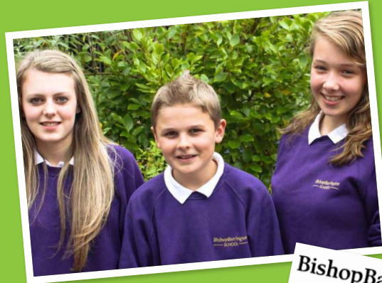
Bishop Barrington SCHOOL